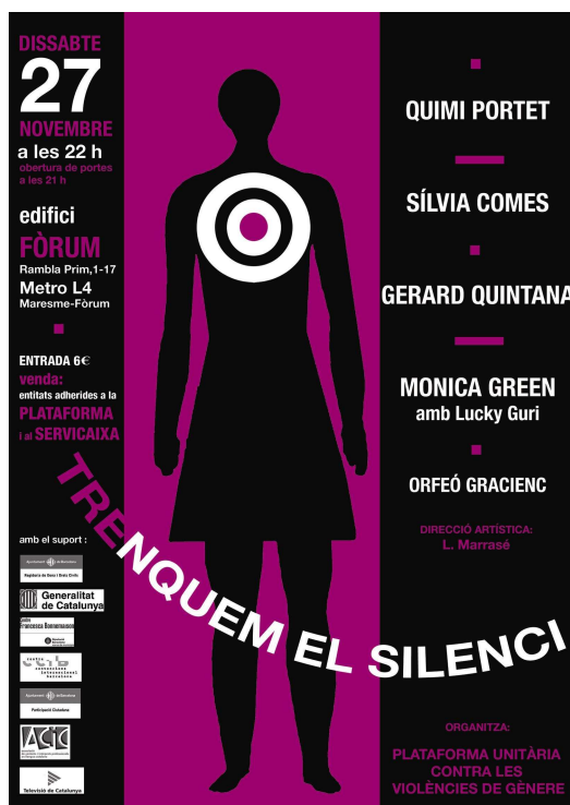
Concert poster 2004

The organization of the event involved all the departments of the City Council and of the Generalitat de Catalunya, and most of the social fabric of the city and of Catalonia. 1500 people attended, including representatives of institutions and the event saw the consolidation of the Platform (with over 60 organizations) as a social movement against violence to women.