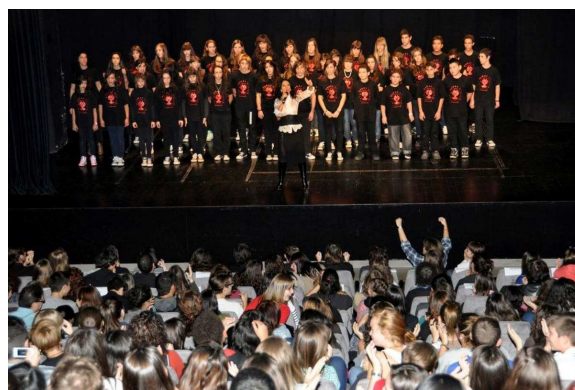
Awards ceremony. Coral IES The Palau and audience