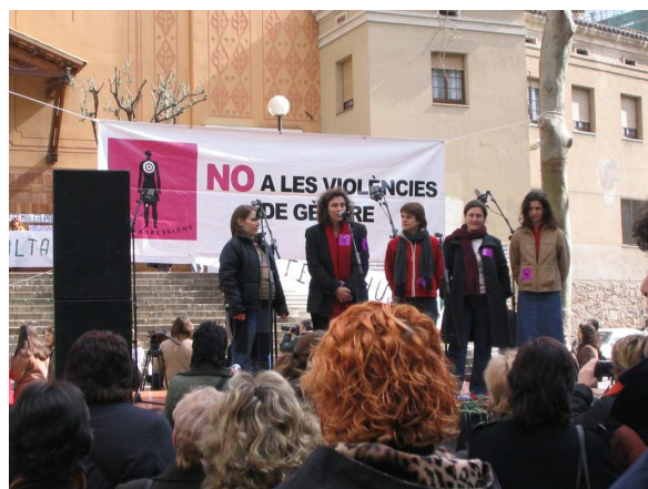
Concentration Sants –Montjuïc, February 29, 2004