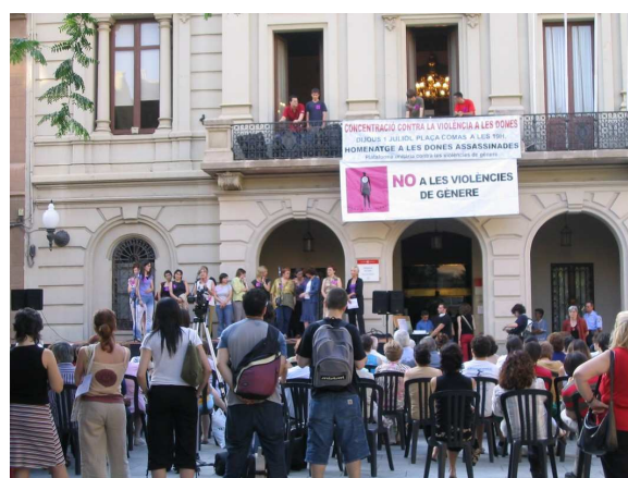
Concentration Les Corts District, July 1, 2004