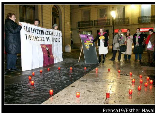
Concentration Pl Sant Jaume, February 18, 2008

Número d'inscripció al Registre d'Associacions: 29709