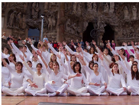
Sagrada Família. Dones de Blanc, February 23, 2003

From November 2002 until 2004, the platform was supported by the City of Barcelona and the Generalitat de Catalunya as such but with the fiscal document of some member associations. On September 12, 2004, The United Platform against Gender Violence was legally established, with 22 initial member institutions. The event took place in Barcelona at the Espai Francesca Bonnemaison. The first acts of public awareness (concentrations) were in different neighborhoods of Barcelona: Sagrada Família (23 February 2003), Nou Barris, (May 11, 2003); Horta-Guinardó (July 6, 2003), Gràcia ( November 23, 2003), Sants-Montjuïc (February 29, 2004), Les Corts (July 1, 2004); San Martí (10 November 2004).