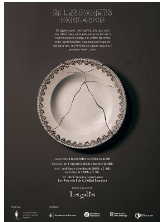
Poster exhibition 2010