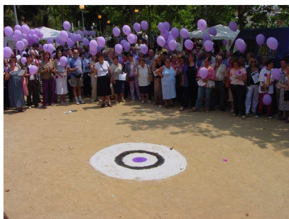
Horta-Guinardó (July 6, 2003)