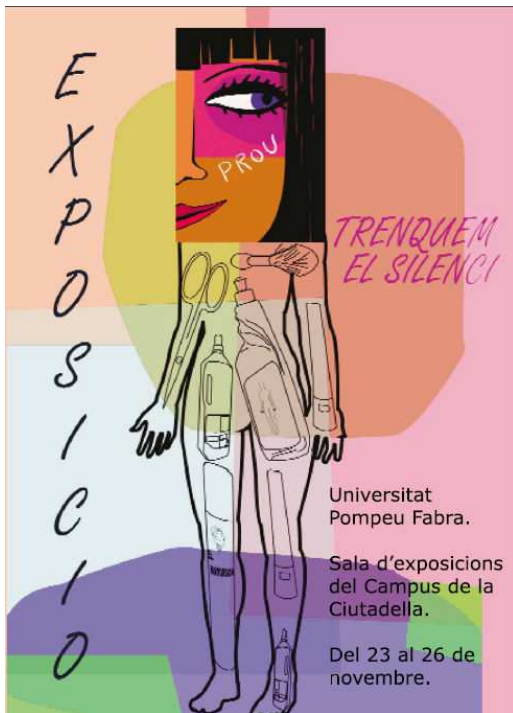
Poster exhibition 2009

Plataforma unitària contra les violències de gènere Rambla de Santa Mònica, 10 1ª planta 08002 Barcelona Telf. 627398316 prouviolencia@pangea.org - www.violenciadegenere.org NIF: G63627418 Número d'inscripció al Registre d'Associacions: 29709