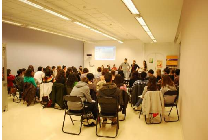
Meeting youth debate between Austria and Barcelona, the project "Breaking myths, we are equal", during the VIII Forum against gender violence, 2011

Plataforma unitària contra les violències de gènere Rambla de Santa Mònica, 10 1ª planta 08002 Barcelona Telf. 627398316 prouviolencia@pangea.org - www.violenciadegenere.org NIF: G63627418 Número d'inscripció al Registre d'Associacions: 29709