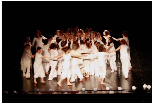
Performance Blanc Gifts of the closure of V forum against gender violence

create choreography that represents different local neighborhoods and Barcelona. So far, there are five choreographies created: Dones en llibertat (Women in Liberty), Dret a decidir (The Right to Decide), Lluny de qui soc (Far from being who I am), Obrint camins (Opening Roads), La Solitud de les Dones d'aquí i d'allà (The loneliness of Women Here and There). During 2012, they performed at a total of 9 protest actions at different neighborhood festivals, acting in the Faculty of History at the University of Barcelona, Inauguration of the Cultural Association Torre dels Ocells-Bernet Gallery, November 25 rally against gender violence, Vigil for assassinated women in front of City Hall in the Plaza Sant Jaume de Barcelona, closing the Forum VII against gender violence.